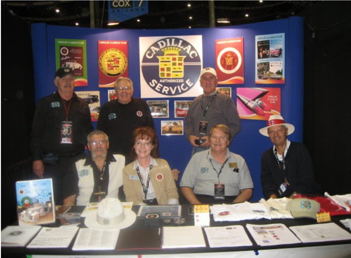
Barrett-Jackson- 2011 C&LC Booth