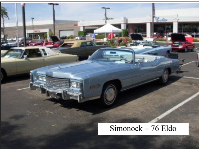
Simonock – 76 Eldo