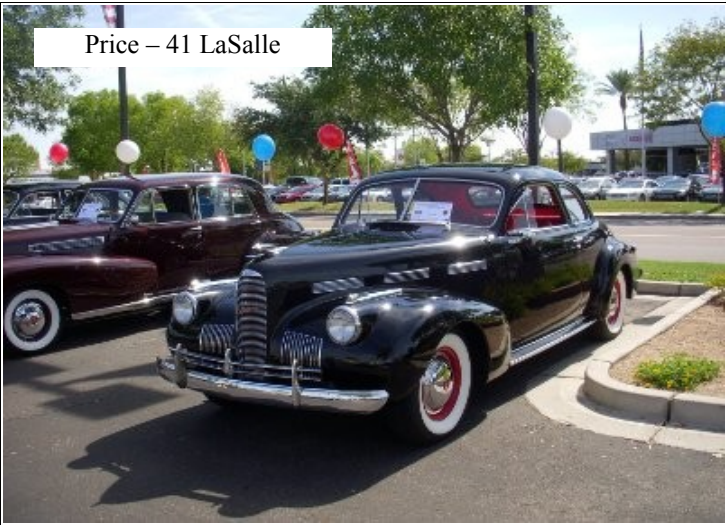
Price – 41 LaSalle