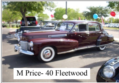
M Price- 40 Fleetwood