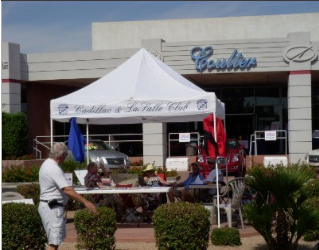
COULTER CADILLAC SHOW – C&LC SDR