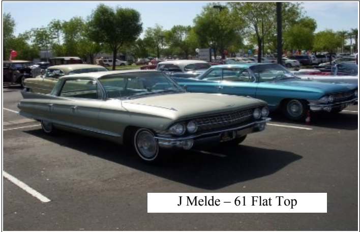
J Melde – 61 Flat Top