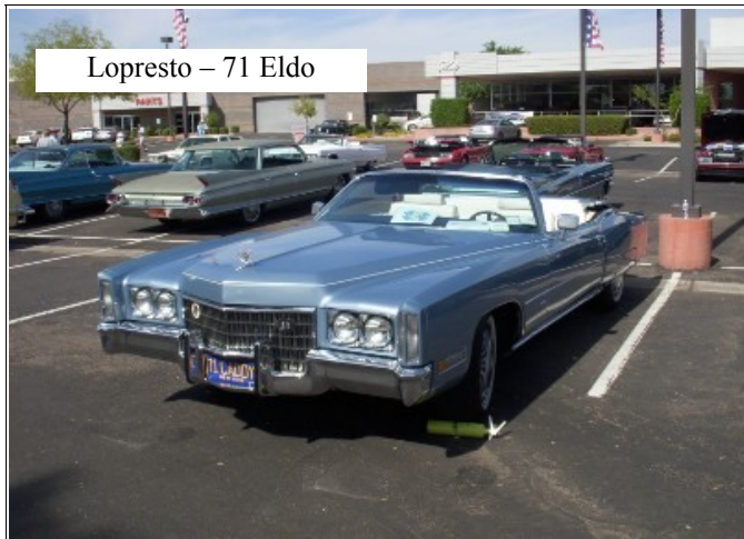
Lopresto – 71 Eldo