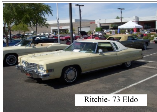
Ritchie- 73 Eldo