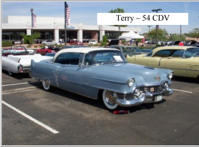
Terry – 54 CDV