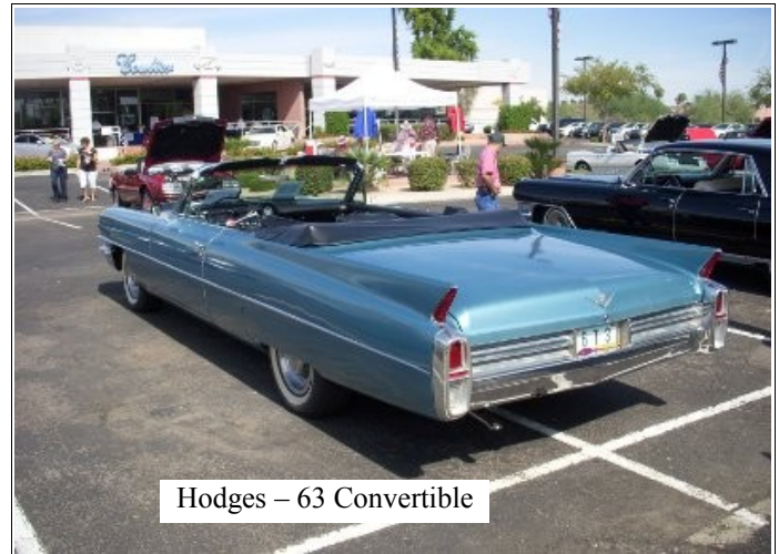
Hodges – 63 Convertible