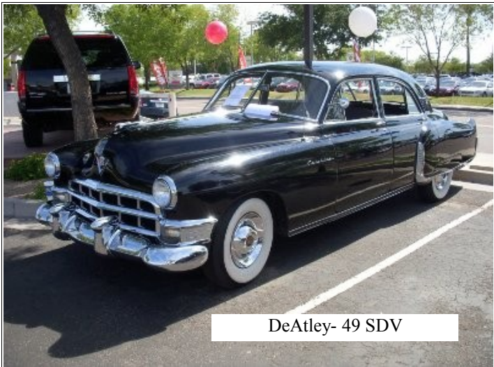
DeAtley- 49 SDV