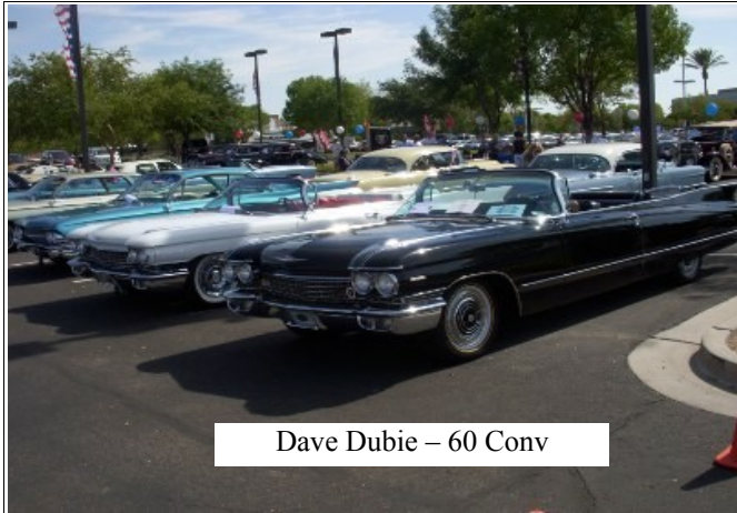
Dave Dubie – 60 Conv