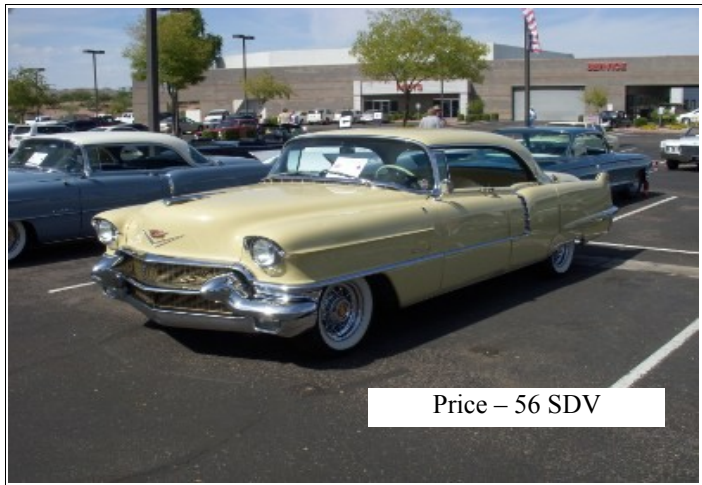
Price – 56 SDV